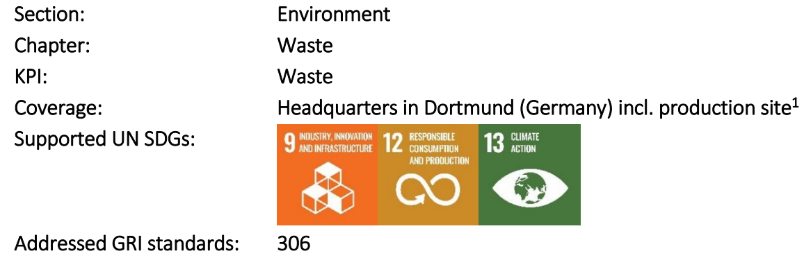
Waste 2 (t)