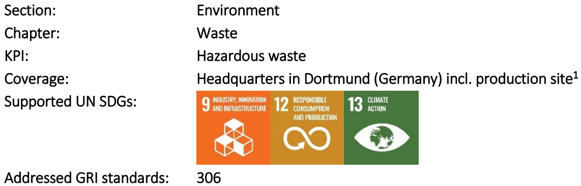
Hazardous waste 2 (t)